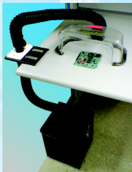
FX200 and FXC501 Cowl Attachment