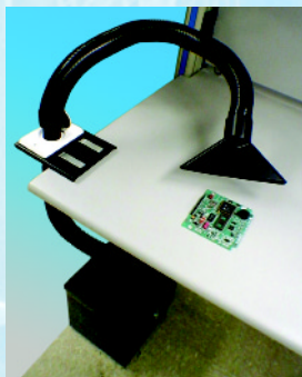
FX200 and FXS5017 Arm Attachment

Introducing the new FX200. A small, quiet single user fume extraction unit. Use the FX200 for isolated operators that need extraction. The FX200 will fit under almost any work surface and comes complete with 6' of flex hose, a table bracket and flip-top connector.